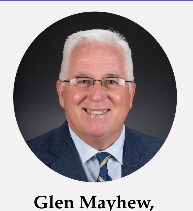
President Commission on Accreditation of Allied Health Education Programs (CAAHEP)